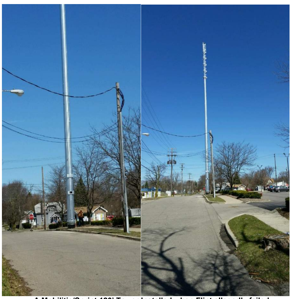
A Mobilitie/Sprint 120' Tower Installed when Flint allegedly failed to Deny a Metro Act Application within 45 days of Receipt