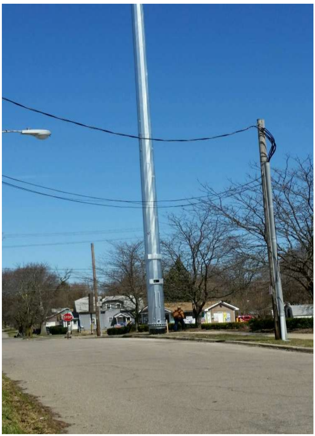
Mobilitie 120' Tower in Flint, MI

g. Fees and Rates: The industry certainly recovers all its costs, plus a profit from all of us as customers. Local communities, on behalf of their taxpayer residents and businesses are as much entitled to recover at least the full cost of the entire DAS/Small Cell Application, review and permitting/franchising process. Furthermore, the ROW are supported by taxpayers who pay property taxes based in part, on market rates. Market rates must be utilized to set ROW rates in order to incent the industry to make their